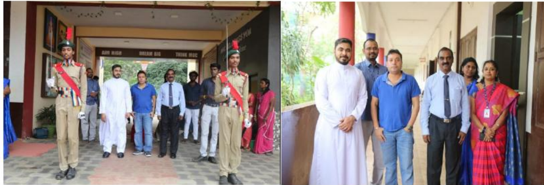
Honouring the Chief Guest