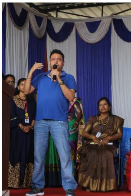
Chief Guest Addressing the gathering