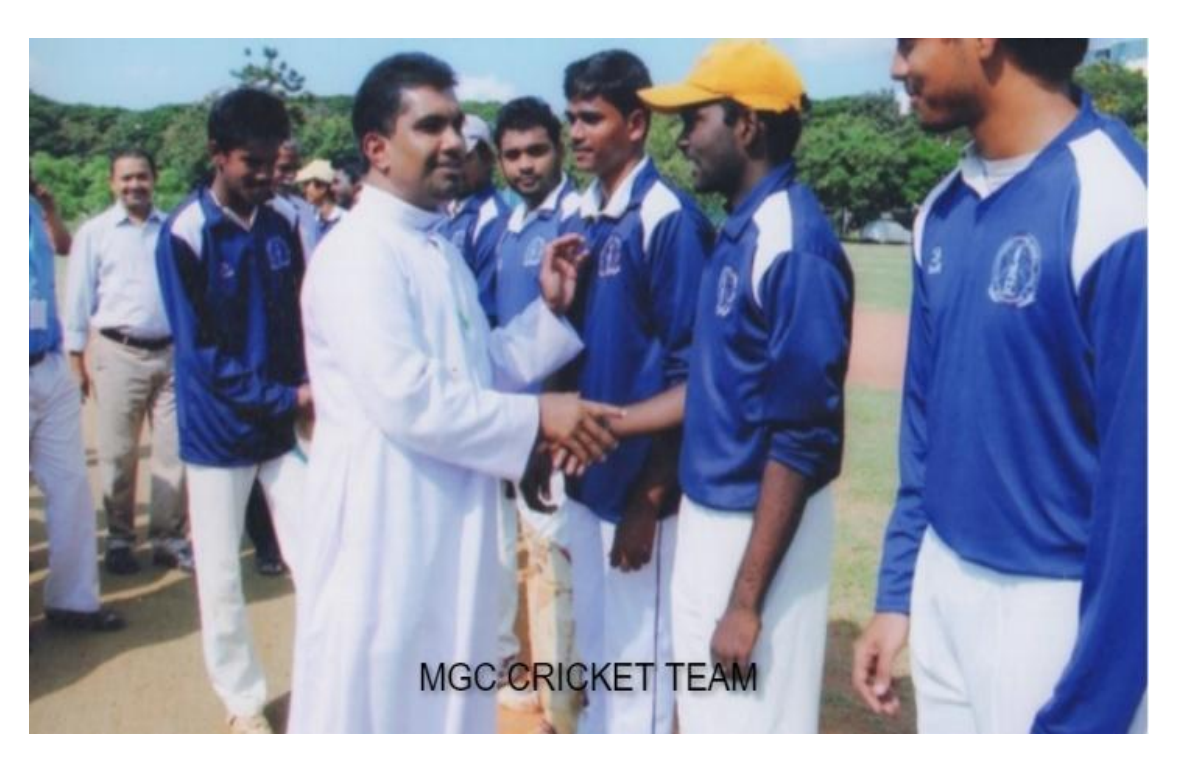
Secretary congratulating the cricket team on {\bf 25}^{th} February 2017