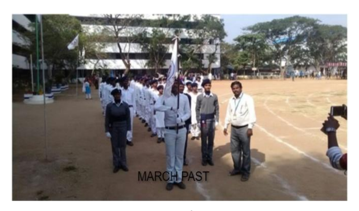
MARCH PAST on 25<sup>th</sup> February 2017 Sports Day.