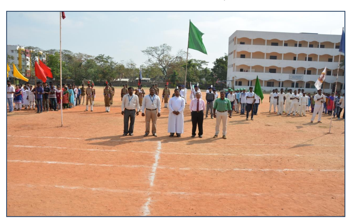
25^{th} February 2017 sports day. NSS.NCC and Four houses ready for March past