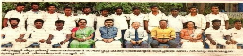
തിരുവല്ലൂർ സ്റ്റേജ് ക്രിക്കറ്റ് ടൂർണ്ണമെന്റിൽ സെമിഫൈനലിൽ മുൻപന്തിയിൽ മത്സരിച്ചതായ മോഗാപ്പാർ കോളേജ് ടീം. വലതുവശത്ത് നിന്നും മുന്നോട്ട്: മോഗാപ്പാർ ക്രിക്കറ്റ് ടീം.