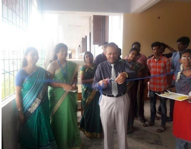
PHOTO OF CLUSTER FEST - 2017