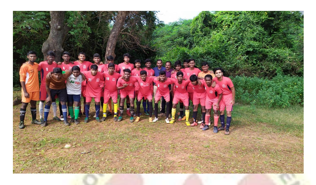
Our college football team won Jaya college in the University of Madras B zone football tournament