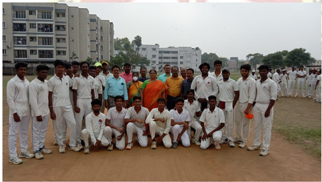
University of Madras B Zone cricket match Mar Gregorios Vs DG Vaishnava College. MGC Won by 23 runs