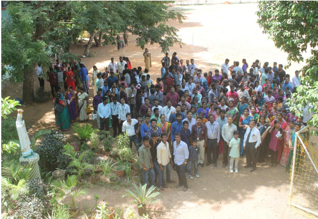
Alumni Meet 2016-2017